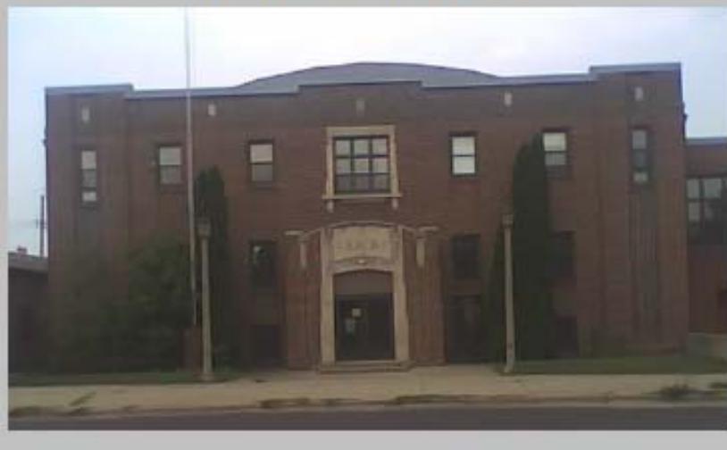
CITY OF PARK RAPIDS