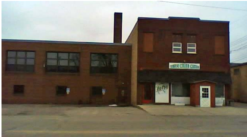
Park Rapids Armory